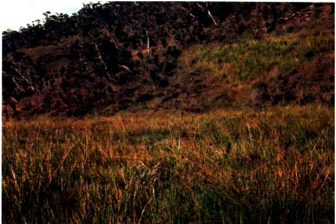
Figure 5. Site 8. Example of narrow valley swamp habitat of the Blue Mountains Water skink