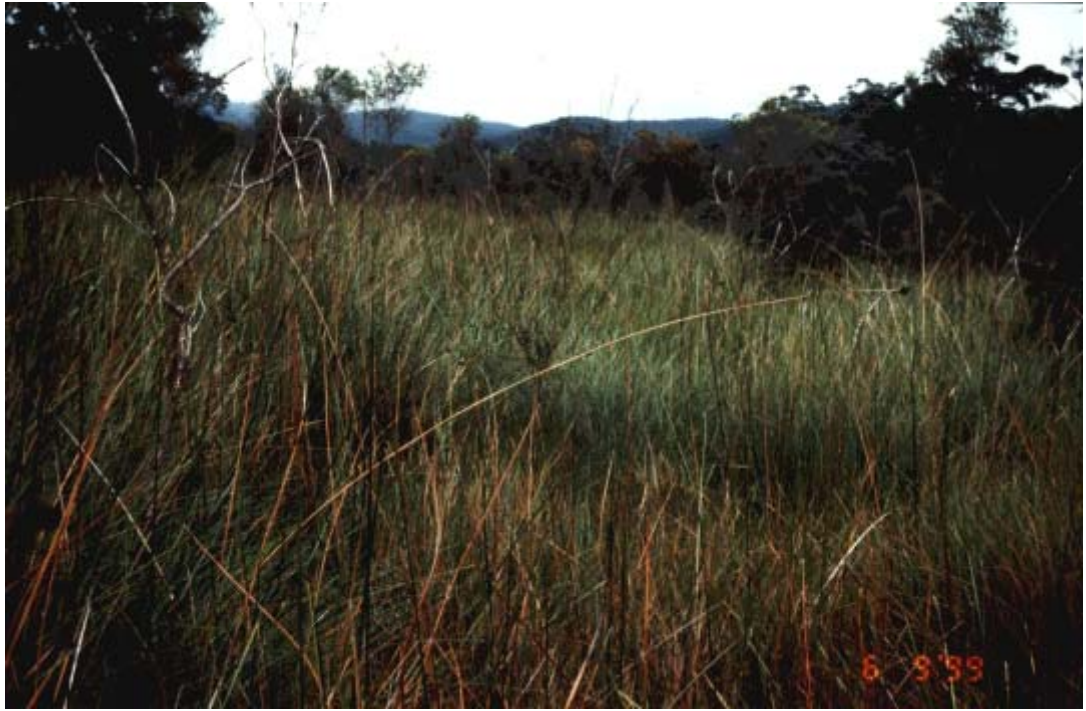
Figure 4. Site 26. Example of perched headwater swamp habitat of the Blue Mountains Water Skink