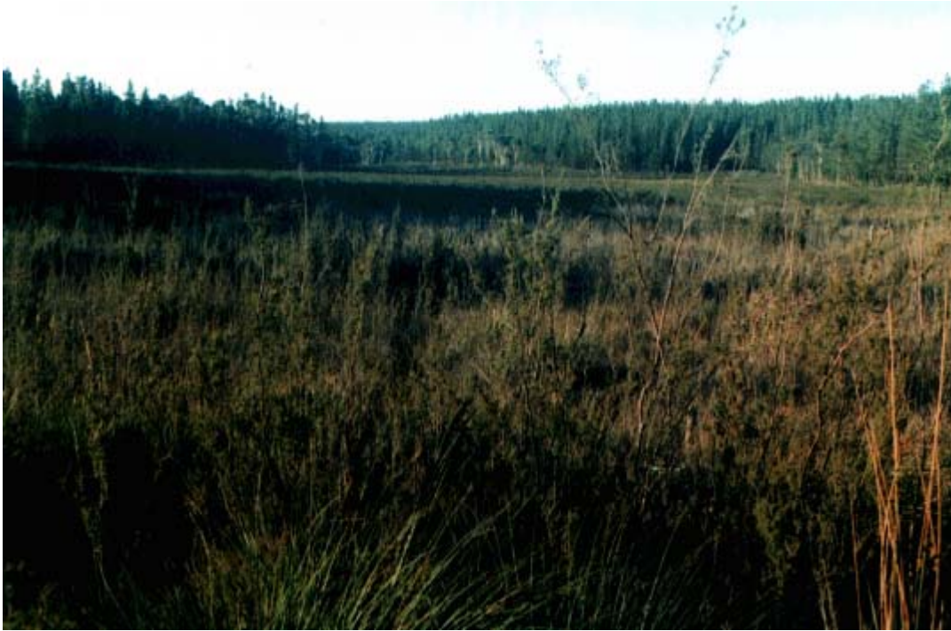
Figure 6. Site 6. Example of low-lying flat swamp habitat of the Blue Mountains Water skink