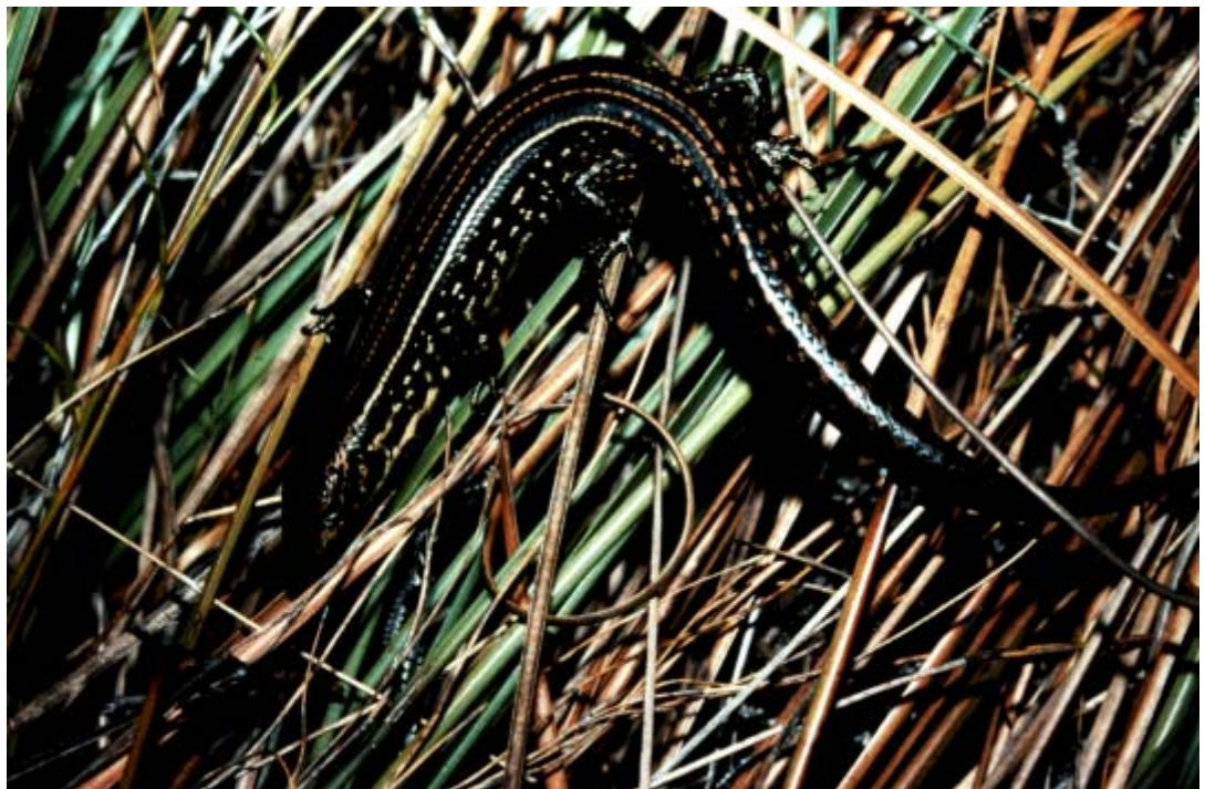
Figure 1. The Blue Mountains Water Skink Eulamprus leuraensis

The body of the Blue Mountains Water Skink is much darker than the other species of Eulamprus found in the Blue Mountains. Across its back it is very dark brown to black with narrow yellow/bronze to white stripes along its length to the beginning of the tail and continuing along the tail as a series of spots (Figure 1). This gives the appearance of a distinctive dark dorsal stripe bordered by yellow lines. The limbs and sides are also dark brown to black with yellow to bronze streaks and small blotches. The head is brown to bronze with black flecks and there are short streaks on the side of the head between the ear and the front legs. The ventral surface and chin is cream to golden yellow with small dark blotches. There is occasionally a ventral green or bluish sheen, especially in juveniles and on the necks of some adults (LeBreton pers. comm. 1999). The limbs are well developed and all have five digits. The taxonomic description for this species can be found in Shea and Peterson (1985). The description of this species in Cogger (1996) includes a colour photograph.